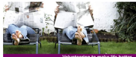
Volunteering to make life better

ig more with your life? Are you wasting your leisure time? Doing the same thing all the time? Over 60,000 people from all over the country have felt the same way. They've become WRVS volunteers, got involved in local activities and developed new skills. Most importantly they have reduced loneliness and older people enjoy life more.