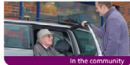
In the community