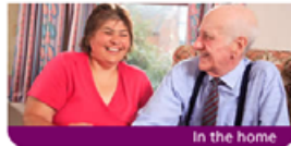
In the home

As well as front-line volunteering roles to support our service users, there are opportunities to help develop our people, increase our fundraising income and raise our profile. So if you'd like to help us with things like HR, communications, recruitment, finance, fundraising, marketing and training, please do get in touch.